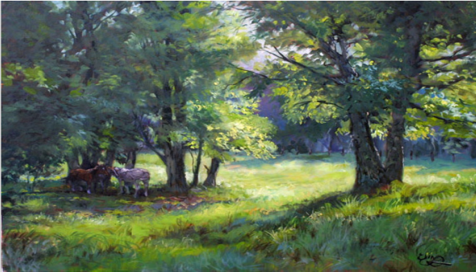
Shown above “ Lazy Morning ” Original oil at the WAOW Saks Gallery in Denver