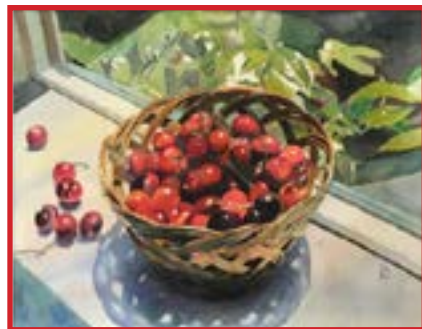
"Early Summer" earned a Third Place prize for Gitta Pfahl

Carol Zaleski rounded out the top level prizes with a Third Place for "Sipping in Porto"