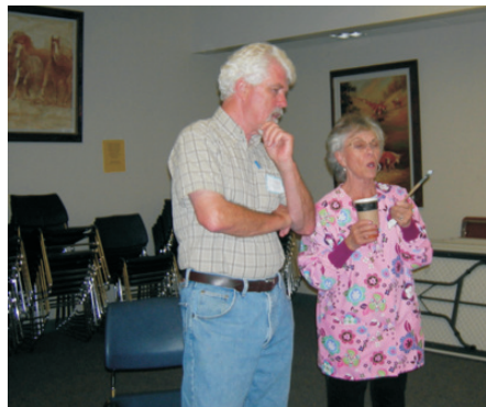
FAA Members at Meeting

Don't Forget! You can buy art supplies at the Brandon Gallery.